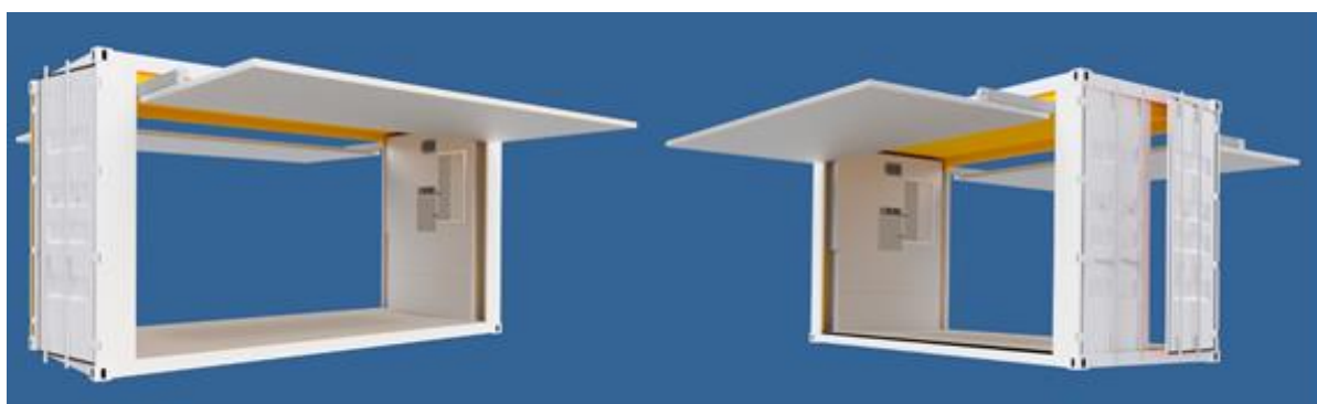
Nanogrid fully deployed with available space for solutions